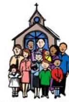
Caring For Our Church Family

Member Care – If you'd like to phone someone when they're ill, help arrange meals or cards for someone while they're sick or postpartum, or help organize weddings or funerals for our church family members. Perhaps the Member Care committee is for you. If you know of someone that may need our care ... please